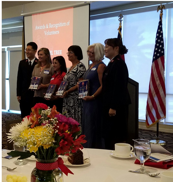
SALVATION ARMY AWARDS & RECOGNITION OF VOLUNTEERS