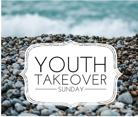
The Youth , led by KT, took over the 9:30 service on January 29th